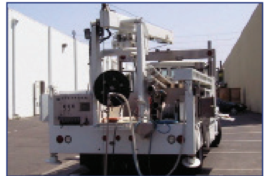
Pump/Development rigs are equipped with low clearance shieve blocks