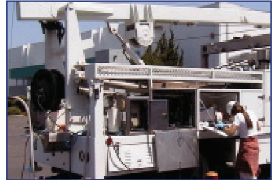
Water quality monitoring cabinet